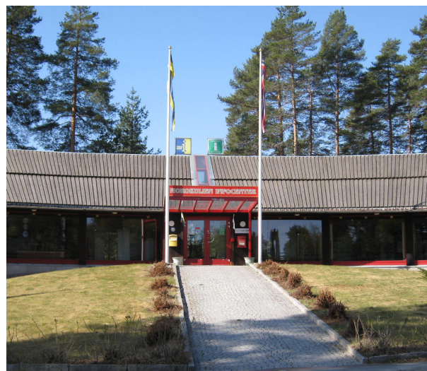
Morokulien, Source: Värmland County

The EURES cross-border partnerships are not the only organisations providing support and advice to cross-border workers. In particular, in border areas with significant levels of cross-border commuting there are also other services available that help citizens to find adequate answers to their manifold questions that arise when they decide to live, work or set up a business in the neighbouring country. For example, with the support of the Nordic Council of Ministers particular Border Service Centres were set up that provide personal assistance and guidance to cross-border workers that have to cope with specific administrative, legal and fiscal requirements. One example is the Bor-